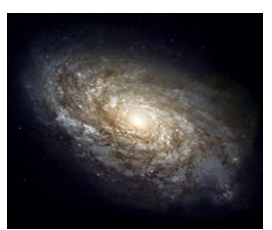
This Hubble Space Telescope image of Galaxy NGC 4414 was used to help calculate the expansion rate of the universe. The galaxy is about 60 million light-years away.

Besides being very hard to imagine, the trouble with an infinite universe is that no matter where you look in the night sky, you should see a star. Stars should overlap each other in the sky like tree trunks in the middle of a very thick forest. But, if this were the case, the sky would be blazing with light. This problem greatly troubled astronomers and became known as "Olbers' Paradox" after the 19<sup>th</sup> century astronomer Heinrich Olbers who wrote about it, although he was not the first to raise this astronomical mystery.