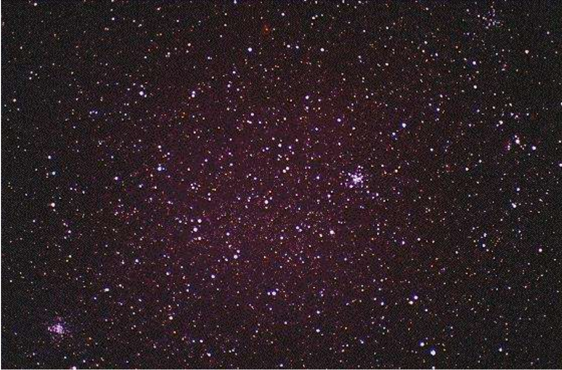
From Upper right to lower left: Open Clusters M38, M36, and M37