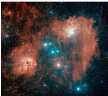
Image IC 405, the Flaming Star Nebula (right) and IC 410, through an H-Alpha Filter, 1520 sec.

IC 405 (Flaming Star Nebula): Emission, Reflection Nebula. Right Ascension: 5h 16m 5s; Declination Dec: +34 27' 49"; Overall Visual Brightness 10.0 (mag), Apparent Dimension Size: 37.0 x 19.0 (arc min).