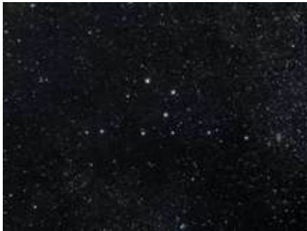
The backwards Coathanger Cluster can be seen at low power.

Brocchi's Cluster, Collinder 399. Open Cluster in Vulpecula. Right Ascension 19:25.4 (h:m) ; Declination +20:11 (deg:m); Distance 0.42 (kly); Visual Brightness 3.6 (mag); Apparent Dimension 60 (arc min).